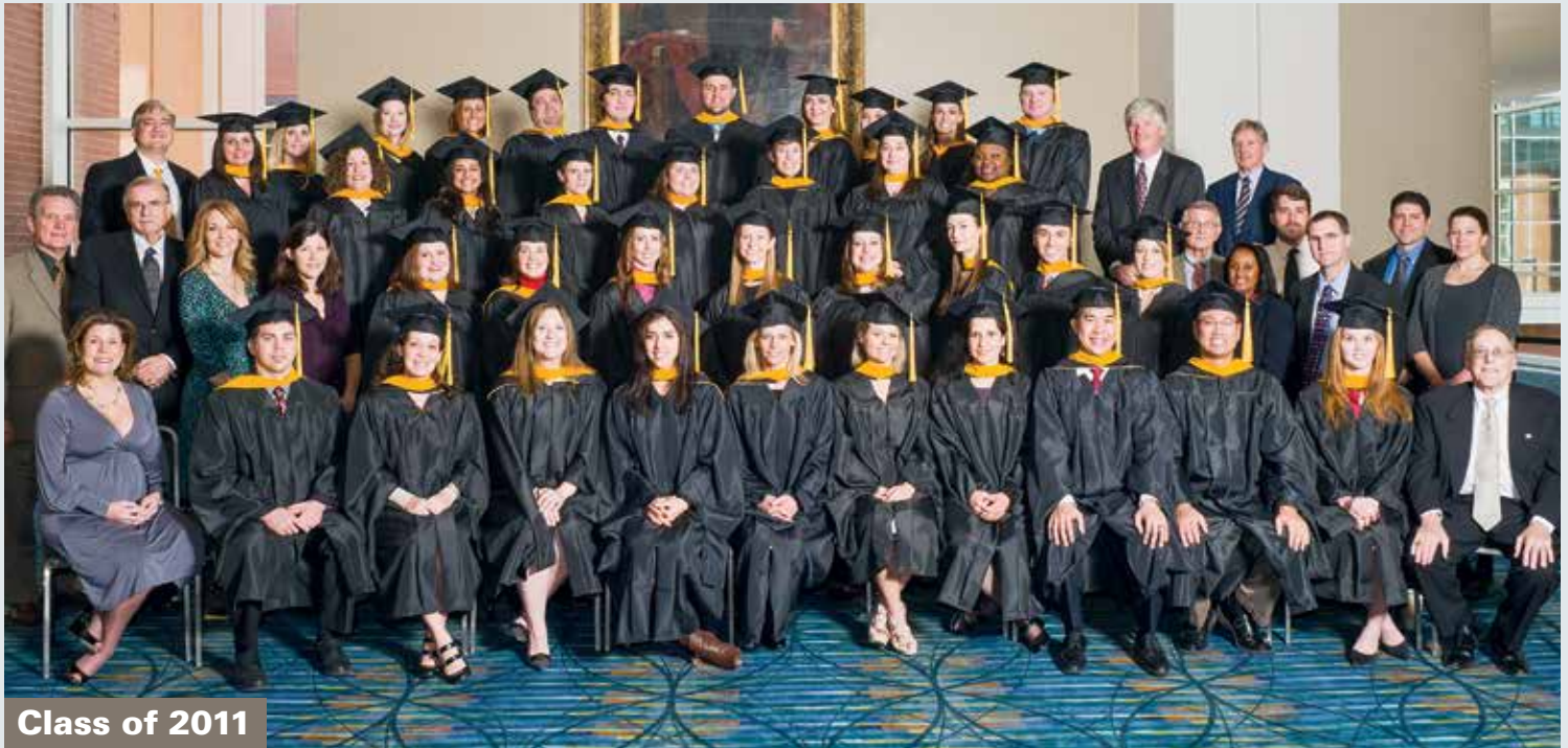
Class of 2011