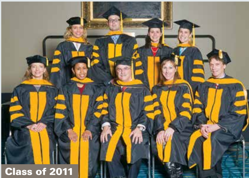
Class of 2011

*Faculty **Chairman †Dean, VCU School of Allied Health Professions ‡Emeritus