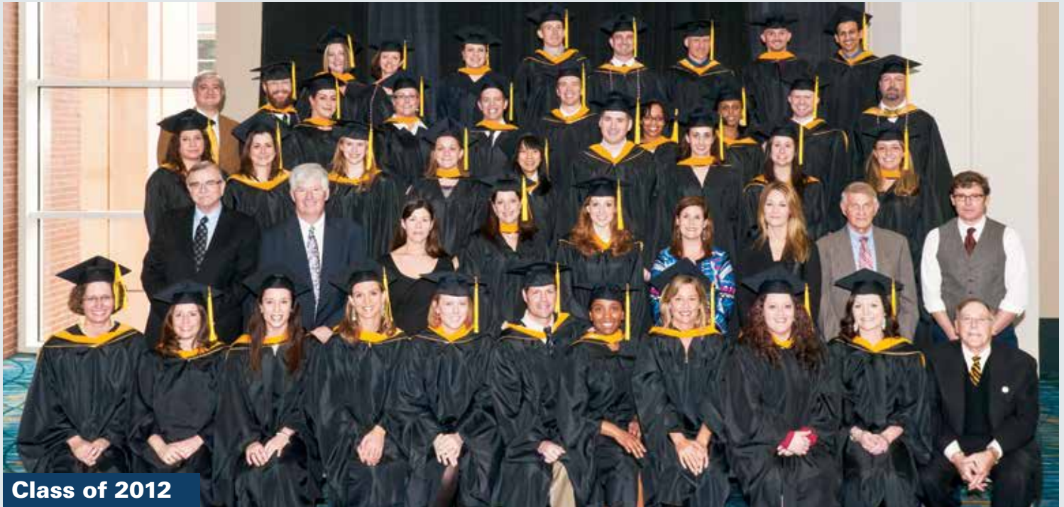
Class of 2012