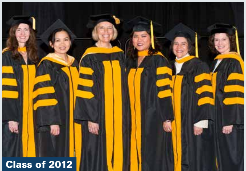
Class of 2012