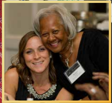
MORE ANNIVERSARY PHOTOS INSIDE!