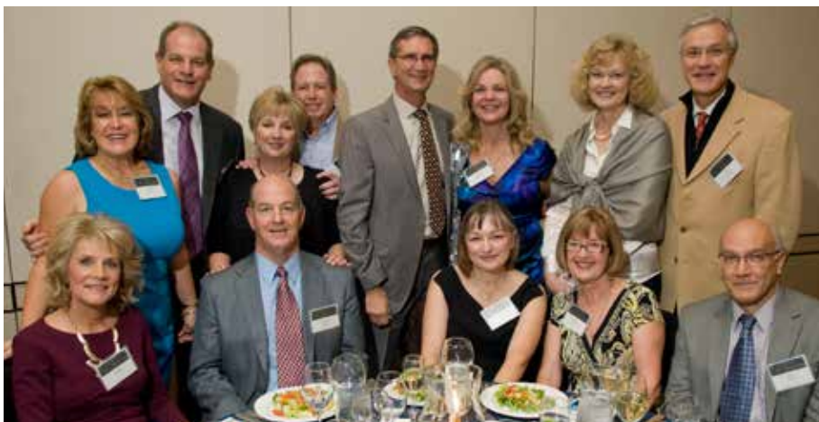
Class of 1984 celebrates its 30th reunion!

SEE THE VIDEO at http://www.sahp.vcu.edu/departments/nrsa/alumni/ .